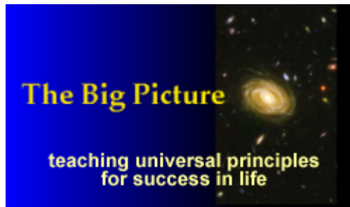
Another Big Picture eBook